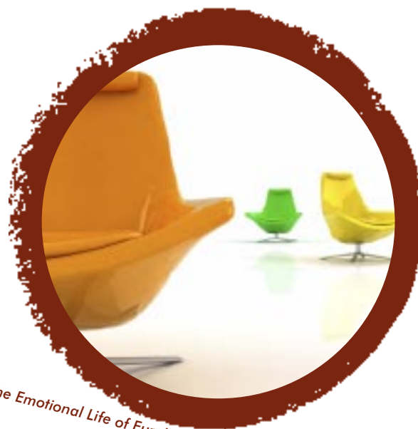
The Emotional Life of Furniture

Reservations: 0141 585 4344, 07886223866